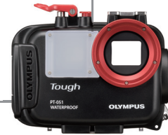
Underwater Case for TOUGH TG-810 / TOUGH TG-610 PT-051