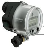
Electronic Flash UFL-2 • Withstand pressure water depth: 60 m

Note: The UFL-2 can only be used for the TOUGH TG-810.